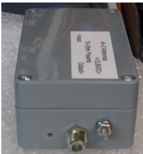
Output and power (13.8VDC)