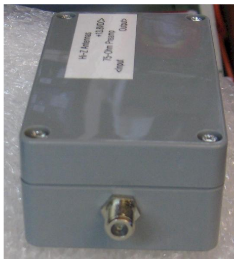
Input End (from phase controller)

To install the Hi-Z 75Ω Preamp, a small (~1 to 2 foot) jumper of RG6 coax and a single wire (with soldered on terminals) of the same length are required. Connect the output from the phase controller to the input of the 75Ω preamp. Connect one end of the wire (13.8 VDC) at the power (13.8VDC) terminal on the phase controller to the power terminal on the 75Ω preamp. The ground is carried over the shield of the RG6 coax jumper.