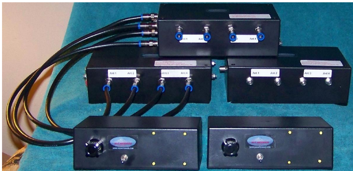
Typical Hi-Z ASC 4 – Two Hi-Z 4 s – One set of 4 Verticals

Congratulations and Thank You for the purchase of our system. We recommend that you read this manual and fully understand the requirements for the proper installation of your system. This manual covers the installation of both systems and is masked accordingly.